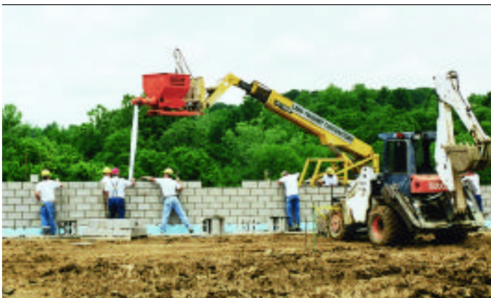
For low-lift grouting, masonry contractors can use a hopper with an auger in the bottom that dumps grout through a hose into the wall.

Bob Weatherton with The Concrete Pump Store states that there are four kinds of pumps that are used to pump grout: progressive cavity pumps, mechanical ball-valve pumps, hydraulic ball-valve pumps, and rock pumps with a swing-tube type valve. Progressive cavity pumps can handle only fine grout and are used for grouting around windows and doors and other small spaces. Mechanical ball-valve pumps are the workhorses of the masonry industry, and pumps with a 4-inch ball valve are the most popular. Hydraulic ball-valve pumps are a newer innovation; they have fewer moving parts so they last longer but are also more expensive. Hydraulic pumps are much smoother than mechanical pumps; similar to the difference between automatic and manual transmissions. Rock pumps that can be used with grout must have a watertight seal on the valve to prevent grout from leaking through into the line and causing blockages. These increasingly popular pumps have been available for only