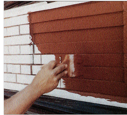
Grouting mortar (above), mixed to the consistency of thick batter, is brushed or floated over the wall surface following the lines of the mortar joints.

To be effective, grouting mortar must cover the brick/mortar interface, thus slightly altering the joint's appearance. Choosing a mortar color close to that of the brick can minimize the visual impact.