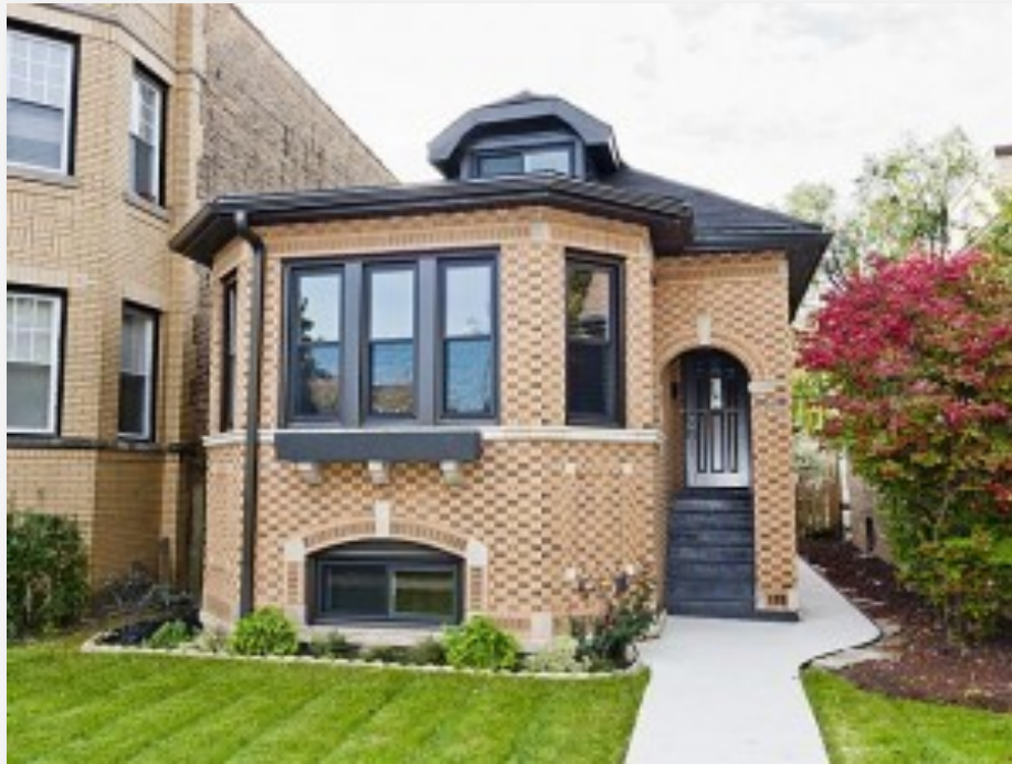
A typical Chicago bungalow with alternating colors of header brick.

In the last 6 months, the Masonry Advisory Council has had 5 calls questioning the use of projected brick? Seems like a lot for such a specific request. Is projecting brick OK to design into a masonry face brick wall? After the momentary excitement this causes our tech guy, this may be a movement toward giving traditional masonry a different feeling, creating new interest. As I traverse the Chicago area for my job I have my radar focused on homes and buildings of the past that had projecting face brick, sometimes it is a full brick sometimes just a header. Alternating colors of header bricks was a common design feature for Chicago bungalows, used to create a unique look.