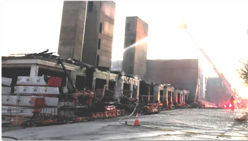
Concrete block stair and elevators outlasted the fire. Concrete block do not burn!

Have you ever slept in a hotel and been able to hear your neighbors' in the next rooms conversation? Concrete block partition walls absorb this noise and enhance the quiet by decreasing sound transmission.