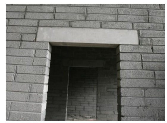
Reinforced concrete lintel