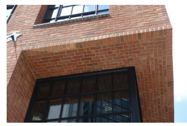
Detailed brick lintel

Historically, different materials have been used to provide support for windows, doors and openings so a masonry wall can continue. The following pictures show brick, stone, concrete block, steel, wood and reinforced concrete providing that support.