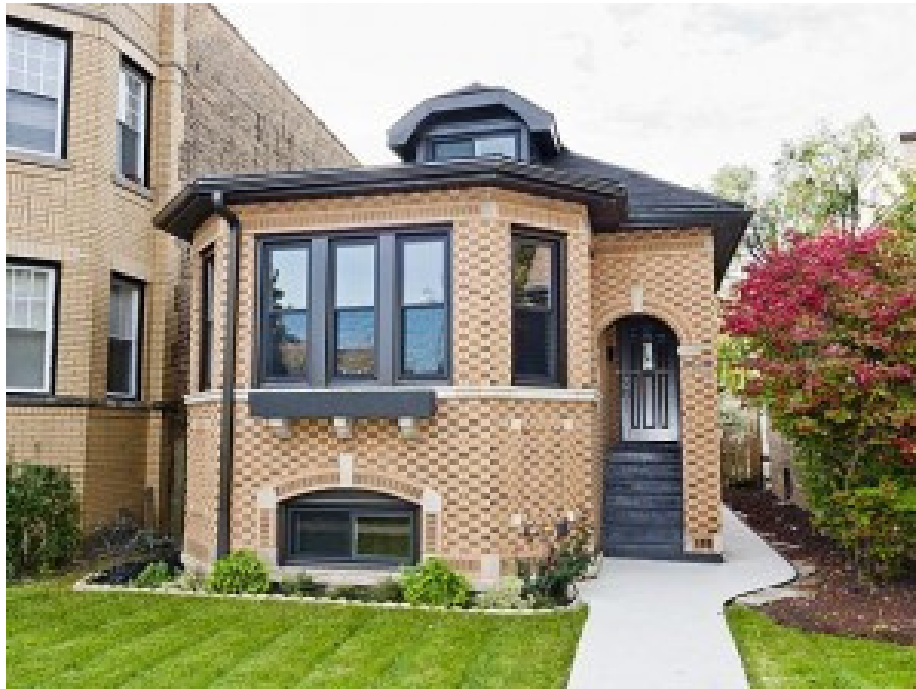
A typical Chicago bungalow with alternating colors of header brick.

In the last 6 months, the Masonry Advisory Council has had 5 calls questioning the use of projected brick? Seems like a lot for such a specific request. Is projecting brick OK to design into a masonry face brick wall? After the momentary excitement this causes our tech guy, this may be a movement toward giving traditional masonry a different feeling, creating new interest. As I traverse the Chicago area for my job I have my radar focused on homes and buildings of the past that had projecting face brick, sometimes it is a full brick sometimes just a header. Alternating colors of header bricks was a common design feature for Chicago bungalows, used to create a unique look.