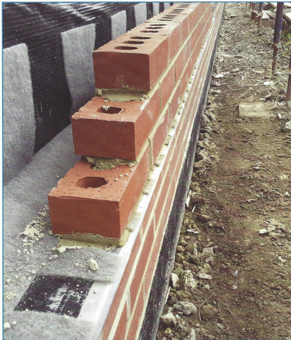
TotalFlash drainage mat weeps.

Corrugated mesh weeps are available from many manufacturers and can be purchased in colors that