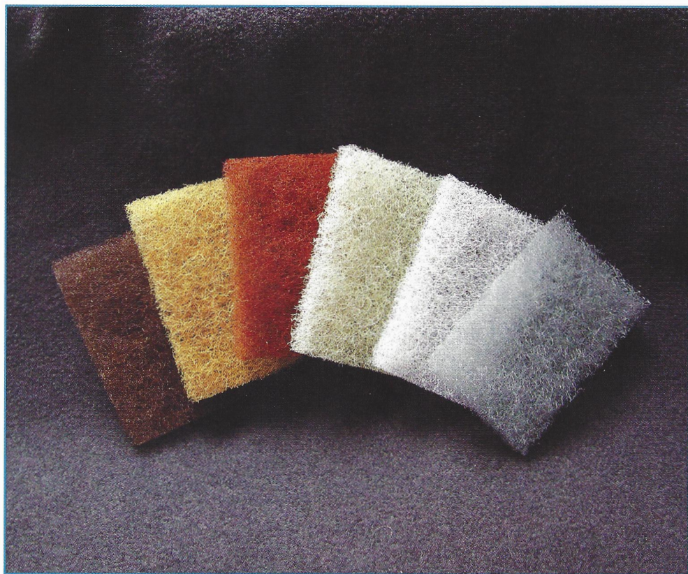
Mortar Net WeepVent.

Flashing and weeps are the means for water to exit the masonry wall.