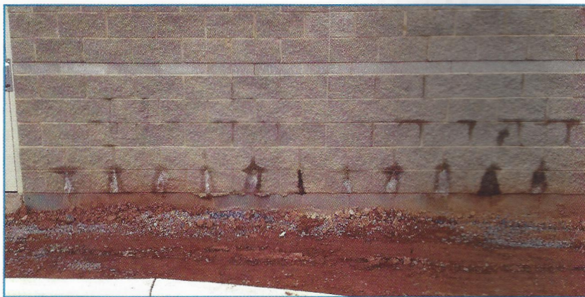
CMU wall weeping excessively due to uncovered walls during construction.