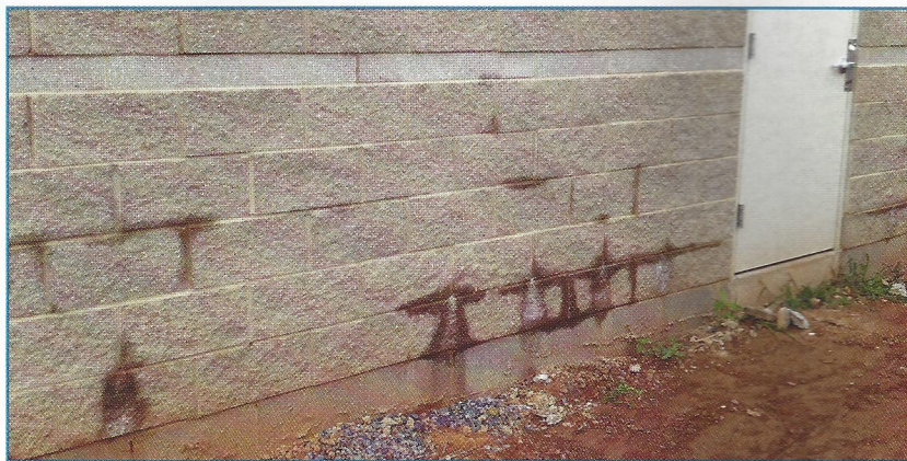
CMU single-wythe wall with functioning weep tubes. The building was dried in at time of photo.

The recommended spacing for rope wick and tube weeps, if used, is no more than 16 inches on center. Most building codes allow no less than 3/16 inch diameter and up to 33 inches on center spacing of weeps. In this case, these wicks need to be at least 16